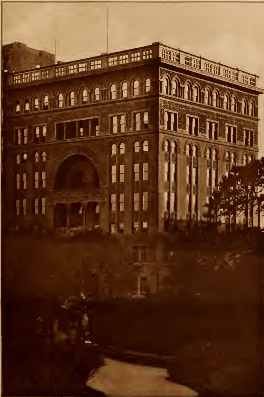
NEW YORK ATHLETIC CLUB, at 59th Street facing Central Park. The leading Athletic Club with thousands of members.